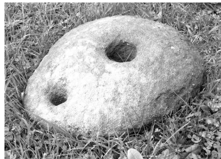
QUERN STONE FROM SUNNYBANK