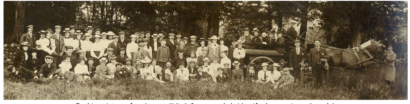
Is this a picture of workers at Skibo? Can anyone help identify the occasion and people? The full picture is in the museum.